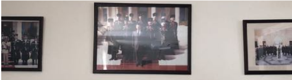
King Abdullah II with his Royal Guard (centre) King Hussein with the Royal Guard (left) and Crown Prince Hussein II with the Royal Guard (right) Hanging up at a Circassian cultural club