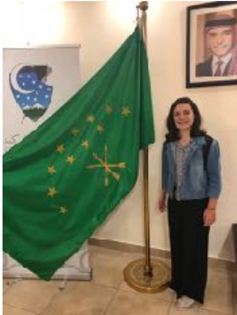
Me, next to a Circassian flag in a cultural club