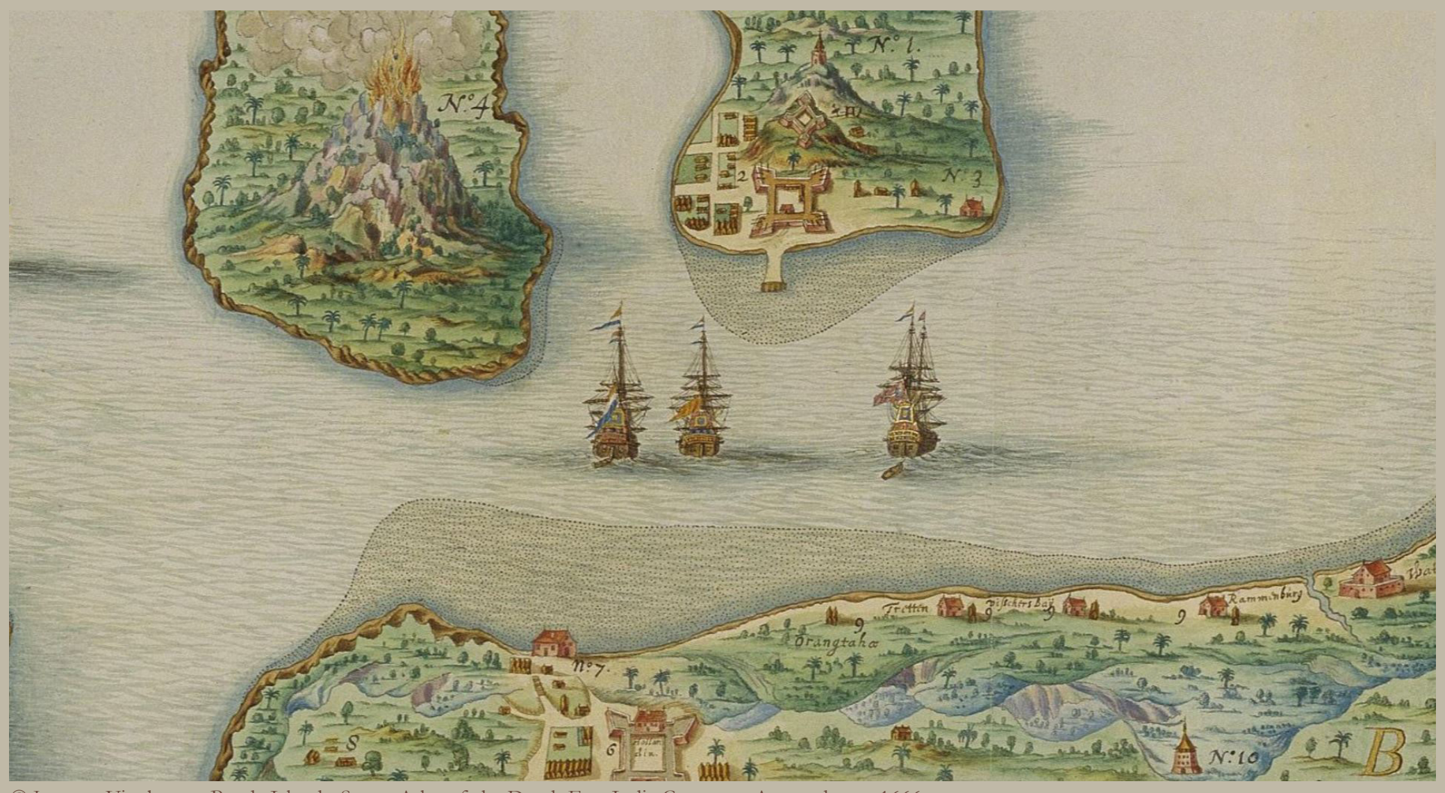
© Joannes Vingboons, Banda Islands. Secret Atlas of the Dutch East India Company, Amsterdam c. 1666