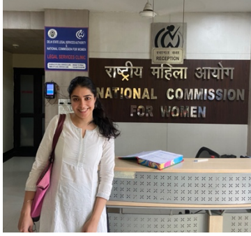
National Commission for Women in Delhi

sexual assault with an aim to formulate coherent recommendations for law reform. Accessing and reading reports spanning over twenty years also allowed me to analyse the development and changes in views on sexual assault law reform over the years.