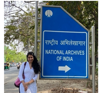
National Archives of India in Delhi

I also had a chance to visit the National Commission for Women in Delhi which had played an important role in the development of the discourse on sexual assault, as well as amendments to the rape law in India since its inception in the 1990s. These visits helped me get acquainted with legal officers at the Commission who pointed me towards various resources in the Commission's library. I also filed multiple Right to Information requests to gain access to advocacy documents and minutes of meetings conducted in the 1990s at the National Commission for Women on reform of sexual assault laws in India. Studying the annual reports of the Commission from its inception helped me understand how the institution developed and shaped rape law reform in India. It also helped me gain insights into different efforts undertaken by the Commission to bring Indian feminists together to discuss and analyse issues related to