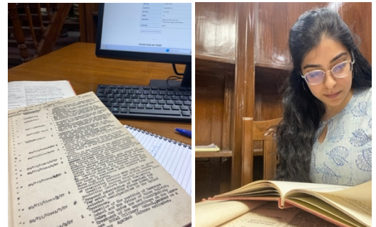
My desk at the National Archives